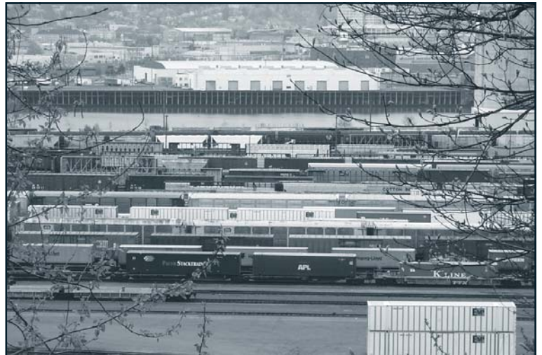
Union Pacific's Albina Yard is the busiest rail yard in the metro area and one of the anchors of Portland's inner city industrial districts.